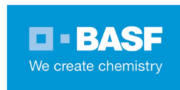
Table Top Display Sponsors